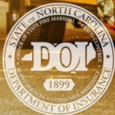
MIKE CAUSEY INSURANCE COMMISSIONER

Did you know!? On a typical day, more than 14,000 school buses carrying nearly 800,000 students operate on North Carolina roads. Passing a stopped school bus can add 4 insurance points & an 80% increase in your auto insurance premiums. For more back to school safety tips, visit: https://www.safekids.org/blog/back-school-blog