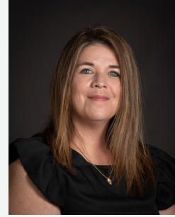
Crystal Heath Resource Specialist